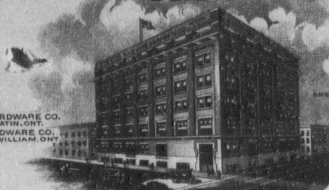
FORT WILLIAM WAREHOUSE

BRANCHES: KEEWATIN HARDWARE CO. KEEWATIN, ONT. THE FIFE HARDWARE CO. FORT WILLIAM, ONT.