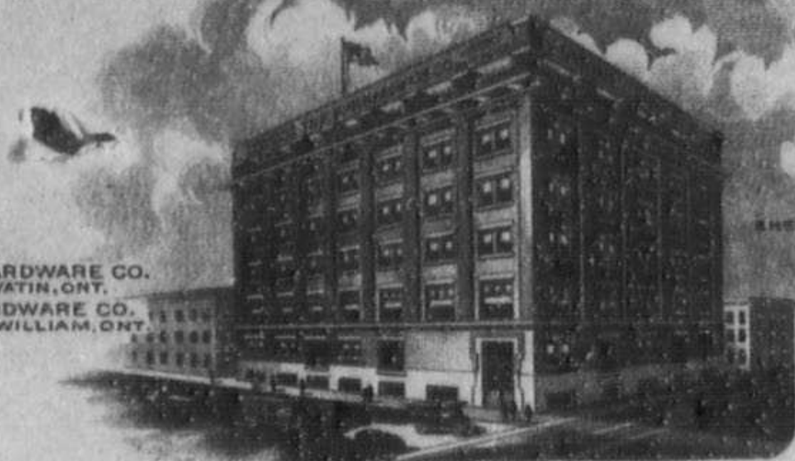
FORT WILLIAM WAREHOUSE

BRANCHES: KEEWATIN HARDWARE CO. KEEWATIN, ONT. THE FIFE HARDWARE CO. FORT WILLIAM, ONT.